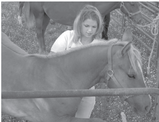
Students groom the horses at the Prussing Agriculture Research Farm.

Research Involving Human Subjects. In order to comply with federal regulations and to protect the health and safety of human subjects involved in research, all research protocols involving the use of human subjects must be in compliance with Academic Procedures and Policies #9: Procedures for Human Subjects Review . All projects involving human subjects in research must be approved in advance by The Human Subjects Review Committee. Forms are available at www.ucmo.edu/osp .