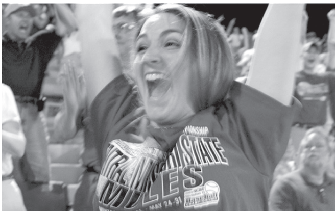
Whether intercollegiate or intramural sports, there's plenty for fans to cheer about at UCM. Admission to regular season sports events is free with student ID.

Fraternities and sororities are a special type of student organization that many students choose to join while at Central Missouri. Students join fraternities and sororities through a process called recruitment which typically occurs at the beginning of each semester. Greek Life offers students the opportunity to develop leadership and organizational skills, participate in community service, and make life-long friends. Friendship, fun, scholarship, community service, and school spirit – Greek life has it all! For more information, visit the Office of Greek Life located in Elliott Union 217 or call 660-543-4007.