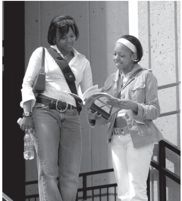
UCM enjoys a student population that is 8 percent multicultural and 4 percent international. Last year students from 44 states and 59 foreign countries attended Central Missouri.

Persons having inquiries concerning the University's compliance with the regulations implementing any of the above are directed to contact the General Counsel, Administration 208, 660-543-4730, or the Director of Human Resources, Administration 101, 660-543-4255, the University of Central Missouri, Warrensburg, MO 64093. Toll-free numbers for Relay Missouri are 800-735-2966 for TTY, and 800-735-2466 for voice callers.