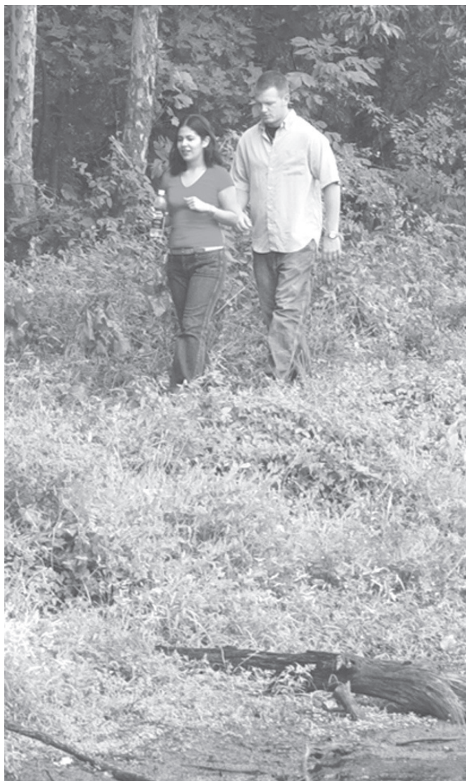
Pertle Springs, a popular recreation area owned by the University, offers hiking trails, a golf course, a lake for boating, and picnic areas.

Five city parks are located within walking distance of campus. Knob Noster State Park, 10 miles east of the campus, offers group and family picnic grounds, hiking trails, and a swimming pool.