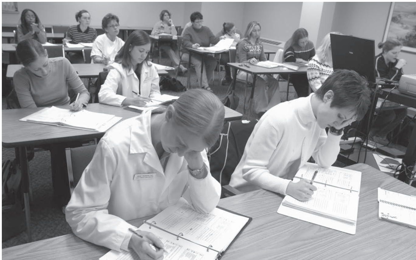
UCM nursing students at North Kansas City Hospital.

Admission to Programs. A student should meet with an Academic Advisor to determine if the College-BASE for General Education Assessment or the College-BASE for Teachers is a criterion for admission to a program.