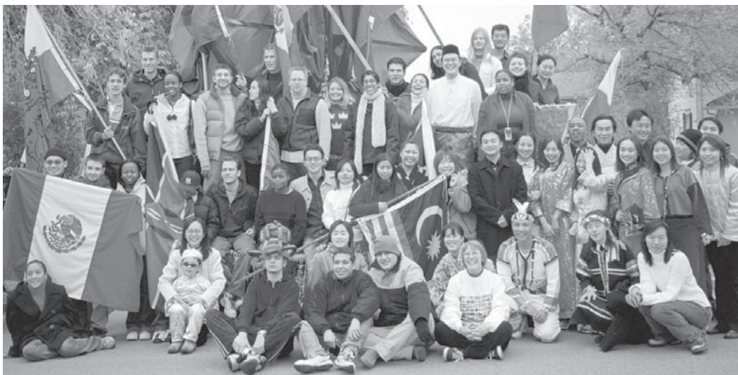
The International Student Organization traditionally sponsors a very colorful entry in the Homecoming parade.

NOTE: An international student normally does not qualify for federal or state financial assistance unless, the student has been designated an eligible non-citizen or a permanent resident by the U.S. Citizenship and Immigration Services (USCIS) of the Department of Homeland Security (DHS). Documentation verifying the student's citizenship status may be required by the UCM Office of Student Financial Assistance to determine the student's eligibility for financial aid.