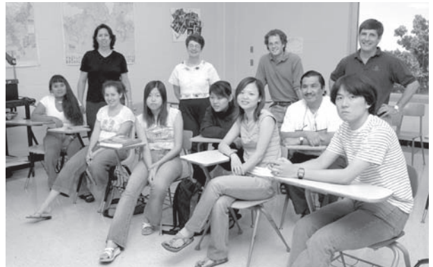
Through Intensive English Program classes conducted throughout the year, including the summers, students learn not only English, but the customs and culture of the United States.

During the orientation session, any international student whose native language is not English will undergo further evaluation for oral and written proficiency and, depending upon evaluation results, may be required to enroll in special classes designed to improve communication skills. The departmental initiated oral and