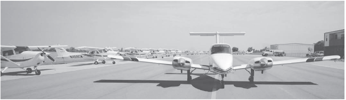
The University's Max B. Swisher Skyhaven Airport is home to a fleet of training aircraft for the aviation program.