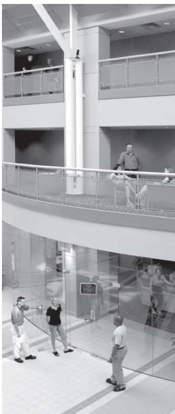
The Office of Admissions is located on the ground floor of the Ward Edwards Building in Suite 1400. The phone number is 877-SAY-UCMO (877-729-8266).