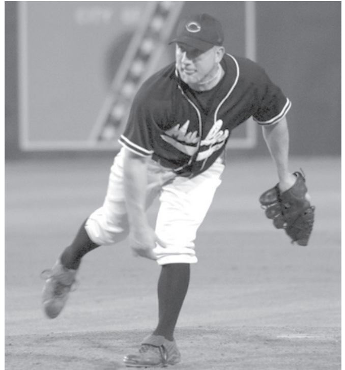
In recent years Mules baseball and Jennies bowling have made it into the national championship playoffs.