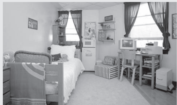
The price of a residence hall room includes local phone service, cable service, Internet access, and utilities. A room comes furnished with two twin beds, one dresser, two desks, two chairs, and a trash can.

Reasons other than those listed may qualify as exemptions based on the determination and at the discretion of the Director of University Housing. The Vice President for Student Affairs shall review appeals of these determinations and the decision upon any such appeal is a final action.