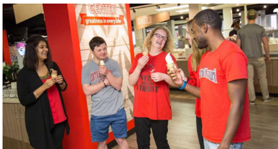
Ellis Dining Center