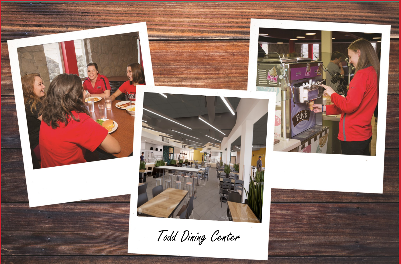
Todd Dining Center

*Unlimited - 16 weeks/7 days a week/3 meals a day = 336 Meals (estimated)